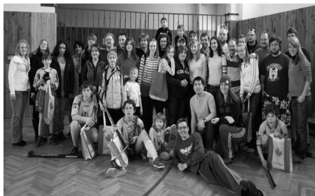
The conclusion of the English camp, after our floor ball game.