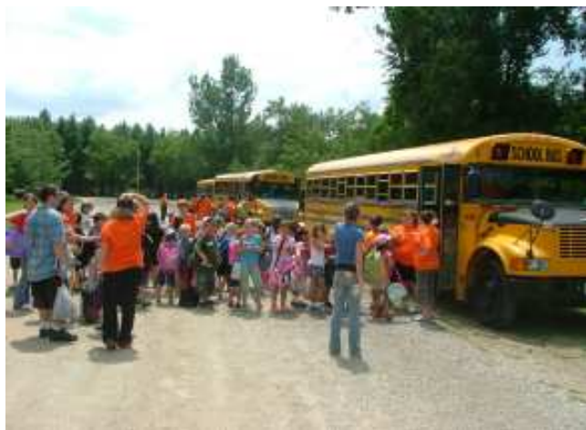
Day Camp at Warwick