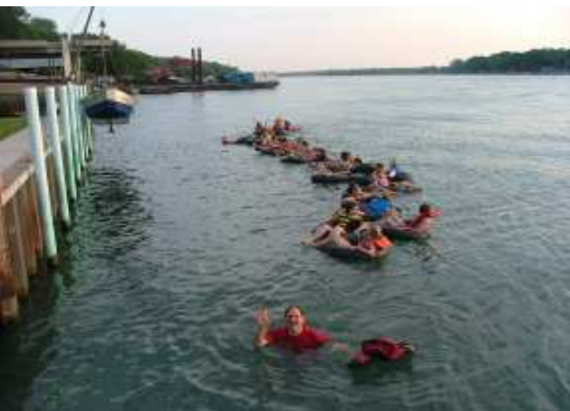
Youth Tubing on the St. Clair River