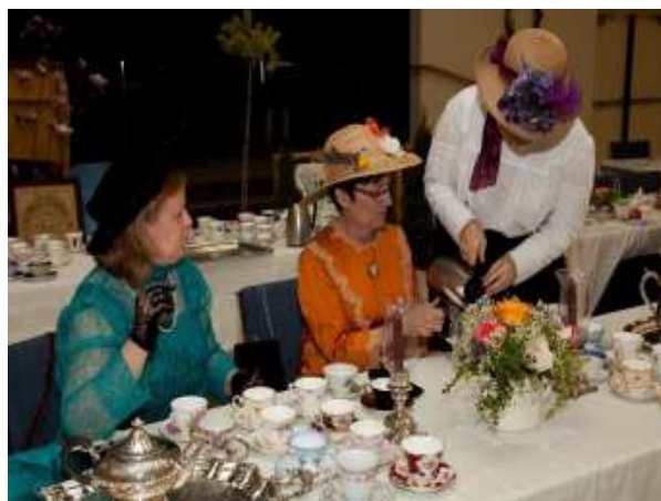
Trinity Tea Ladies