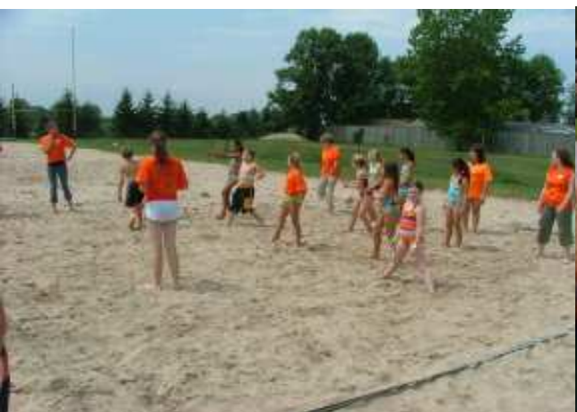
Beach Volleyball at Day Camp