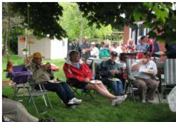
Men's Après-Sail BBQ