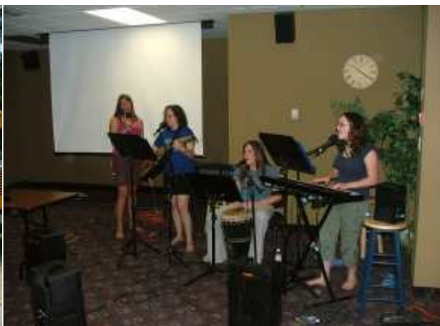
Youth Leading Worship in Cayuga, Ontario